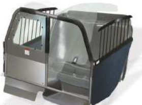
Divider Cage Partitions